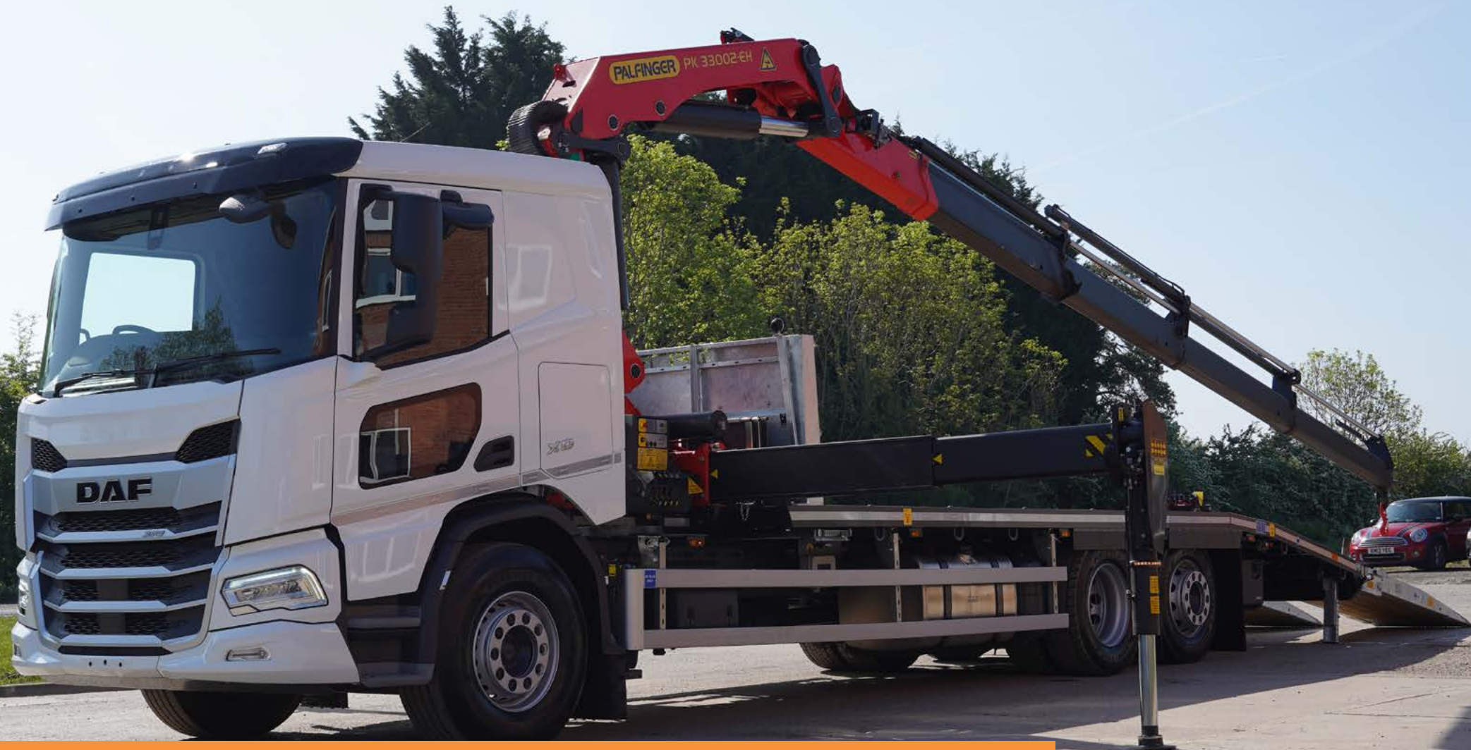
STERLING CRANE LORRY